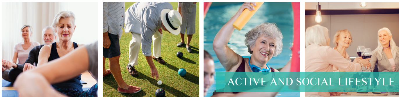
ACTIVE AND SOCIAL LIFESTYLE