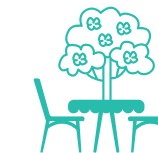
Community Dining Patio