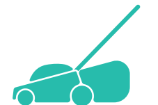
Professional Yard Maintenance