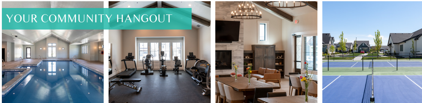
YOUR COMMUNITY HANGOUT