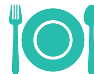
Close to Cafes & Restaurants*