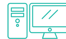
Onsite Tech Center