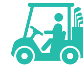
Hit the Links in Minutes*