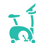
On-site Health & Fitness