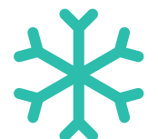
Deep Snow Removal**