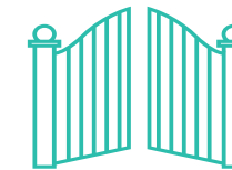
Gated Entry Community