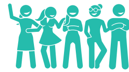
Social Programs Clubs & Events

Be Social. Meet cool people, do cool stuff.