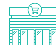
Grocery Store Nearby & Online for Delivery*