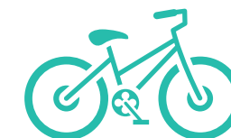
Extensive Bicycle Routes*