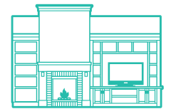
Luxurious Interior Finishes