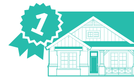
Award Winning Home Designs

The Cadence Life - live in a community curated just for YOU.