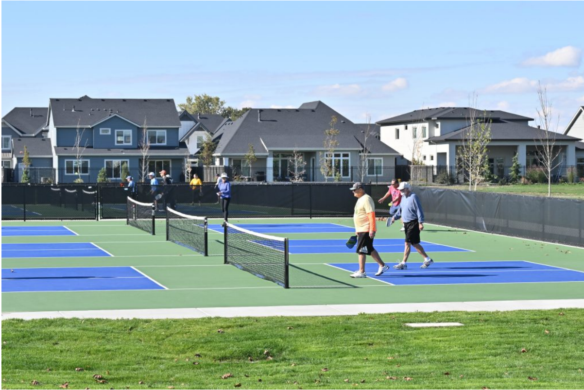
New Pickleball Courts at Discovery Park with Pinnacle Community in the background.