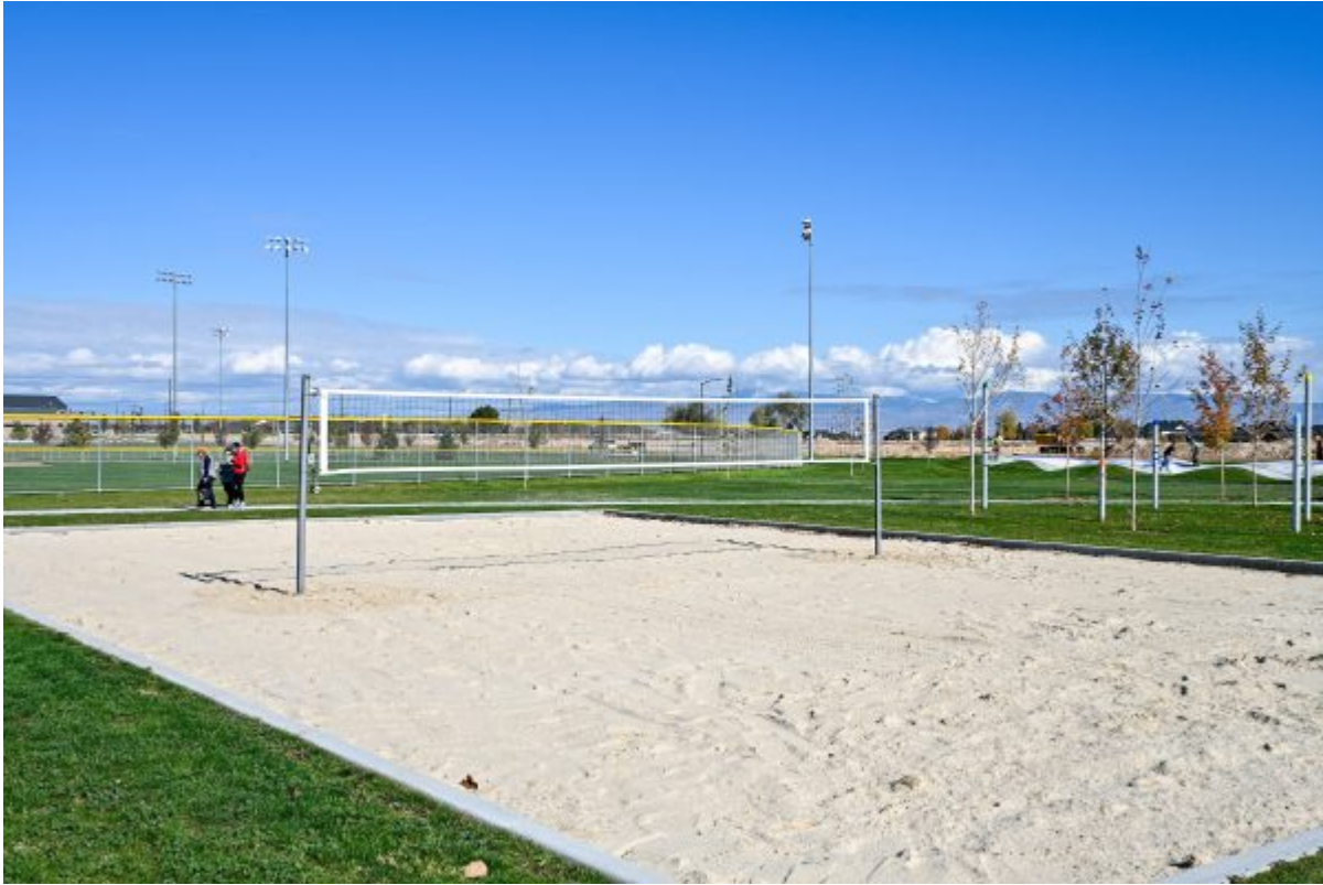
New Sand Volleyball Court at Discovery Park

The original 27-acre portion of the park has nature-themed adventure activities, including zip lines, a climbing wall and boulders, and roller slides. It also has a splash pad, sand/water play area, ball fields, a dog park, and more.