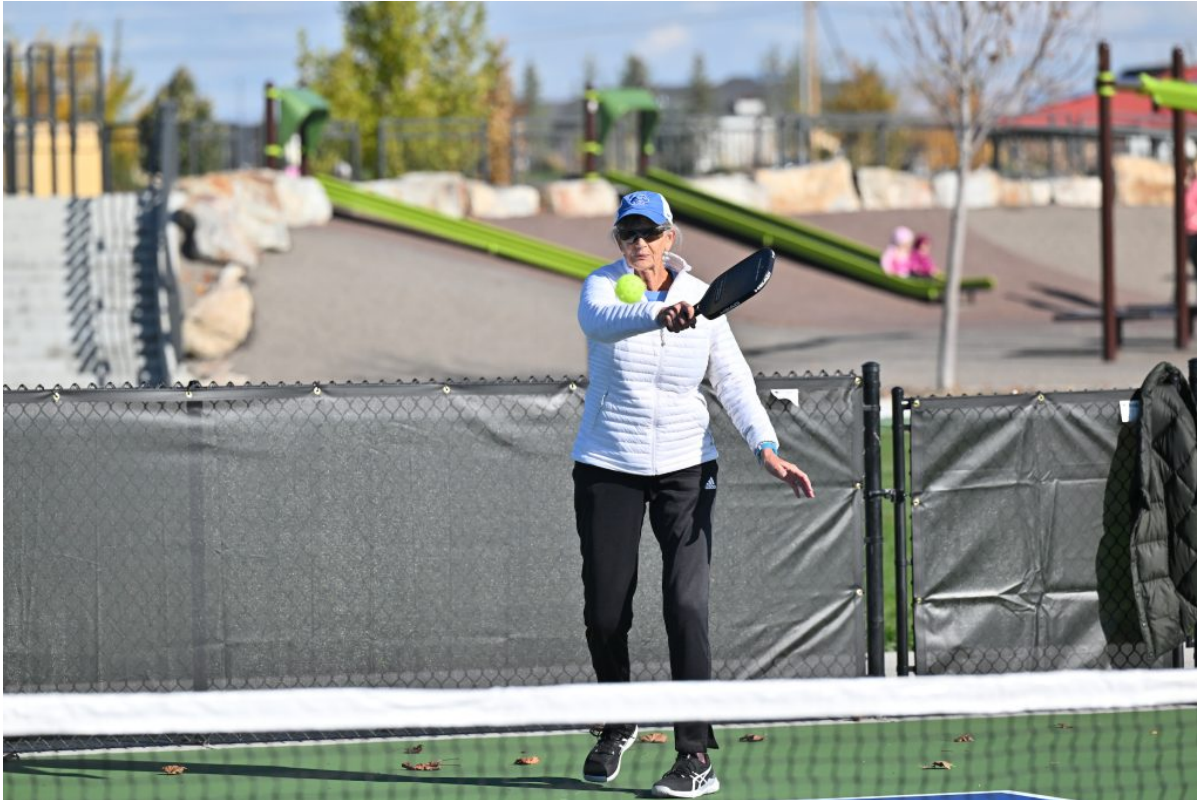
Pickleball Courts with expansive playground in the background at Discovery Park.

Discovery Park is located in South Meridian at 2121 E. Lake Hazel Rd., next to Brighton's Pinnacle community.