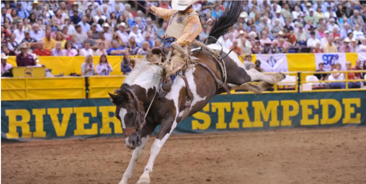
Snake River Stampede