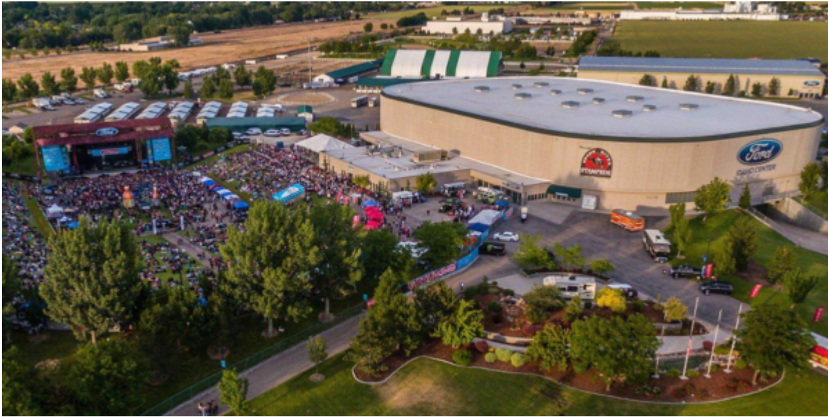
Ford Idaho Center

The Caldwell Family YMCA provides a range of activities, from fitness classes to swimming, perfect for keeping the whole family active. For a fun day out with the kids, visit Babby Farms in Caldwell, a petting zoo with a wide variety of animals.