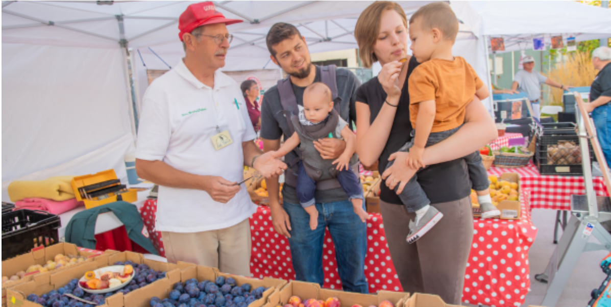
Caldwell Farmers Market