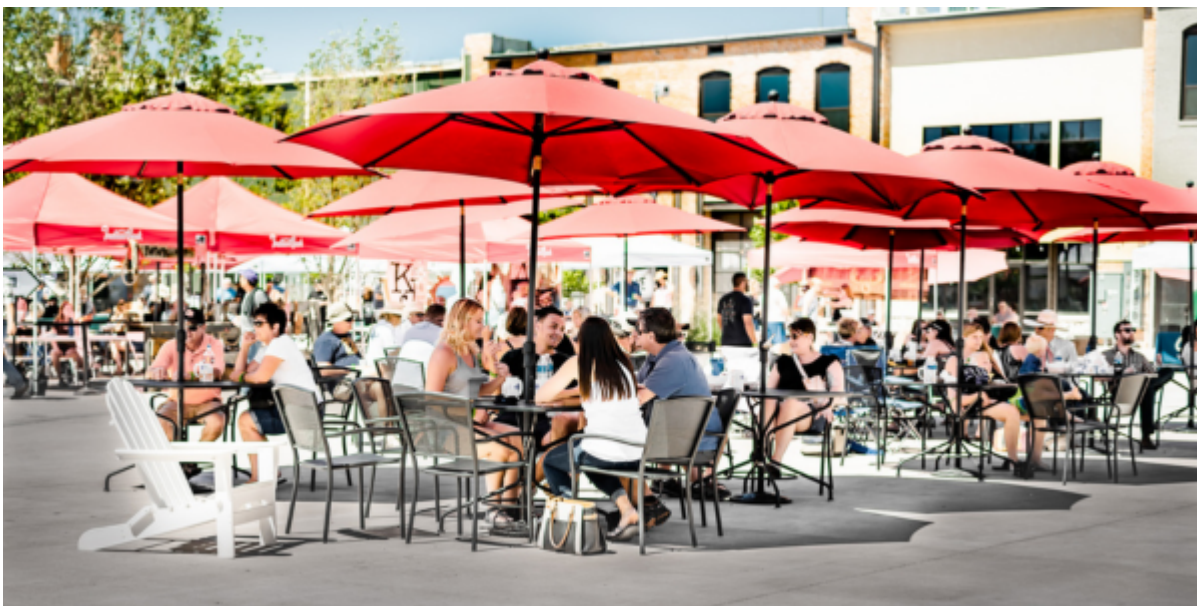
Indian Creek Plaza

For history buffs, the Nampa Train Depot Museum provides a fascinating look at the region's railroad history, while the Orma J. Smith Museum of Natural History in Caldwell showcases an impressive collection of natural artifacts. Don't miss the Warhawk Air Museum in Nampa, where military aircraft displays, and historical exhibits bring history to life. Finally, take a stroll through the Steunenberg Historic District in Caldwell, where you can admire beautifully preserved historic homes and landmarks.