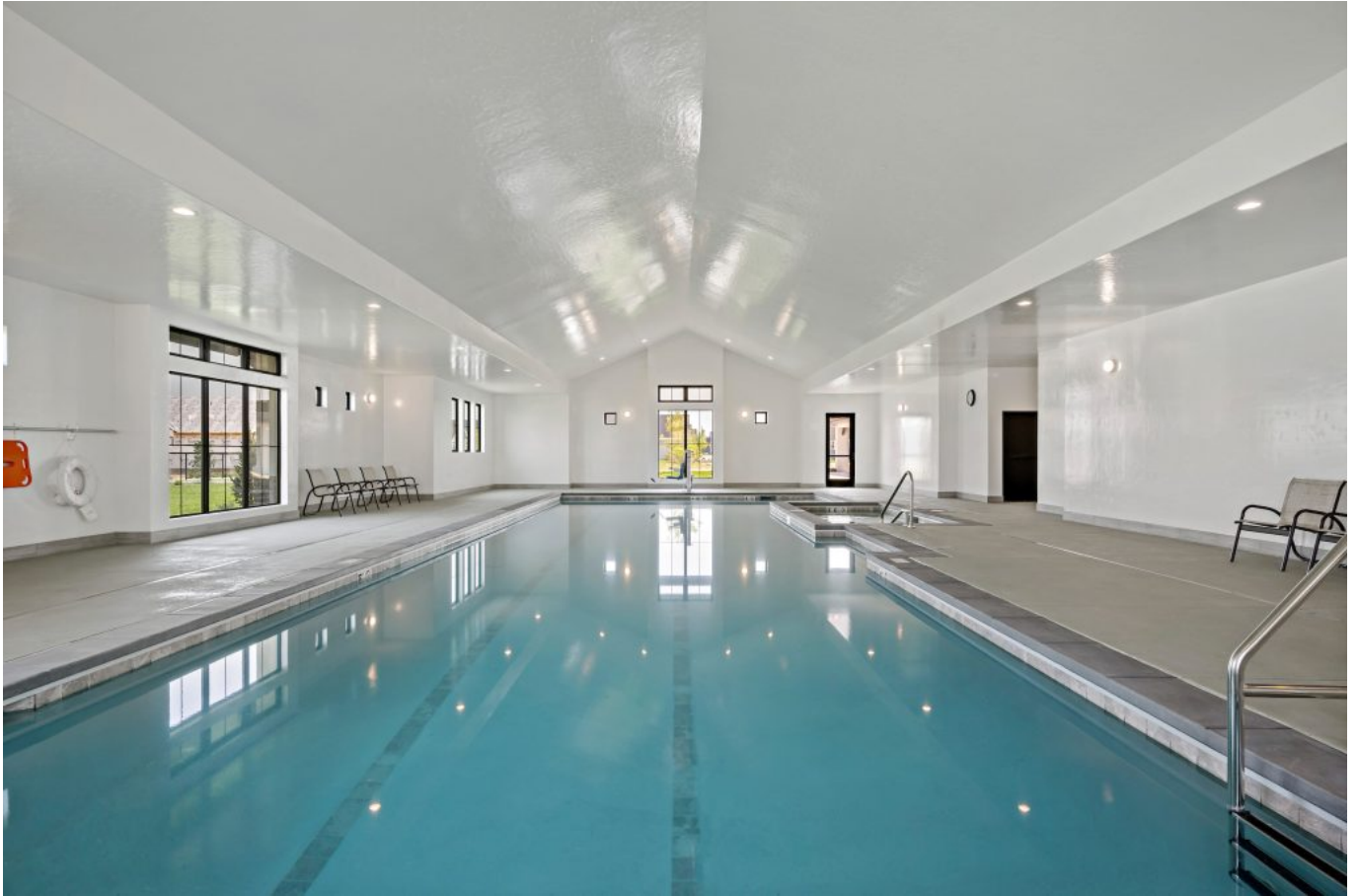
Indoor Pool and Hot Tub Inside the Clubhouse at Cadence in Century Farm, Meridian, Idaho.