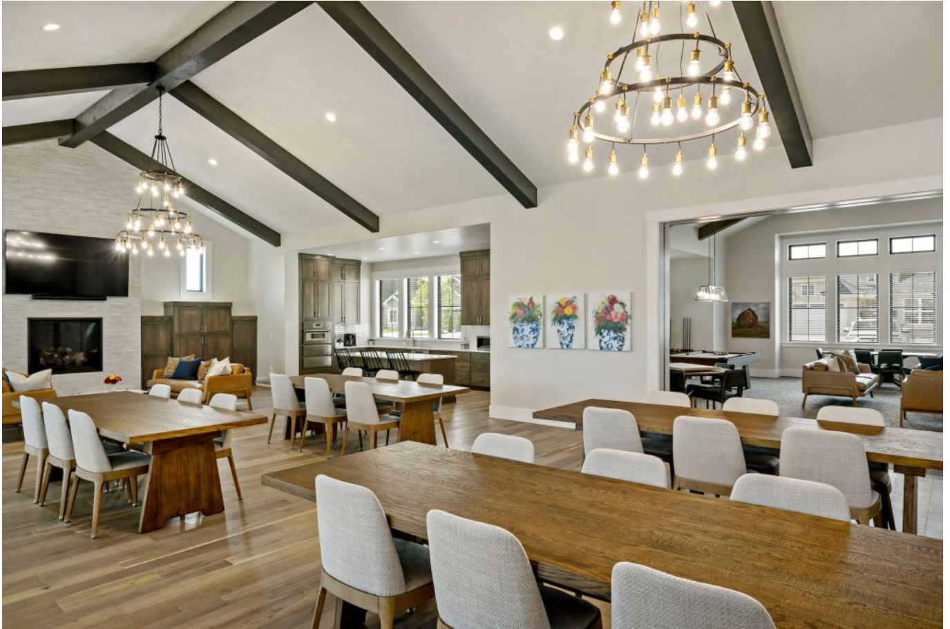
Indoor Gathering Hall Inside the Clubhouse at Cadence in Bainbridge, Meridian, Idaho.